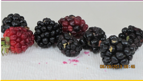
Spotted Wing Drosophila larvae exiting blackberries.