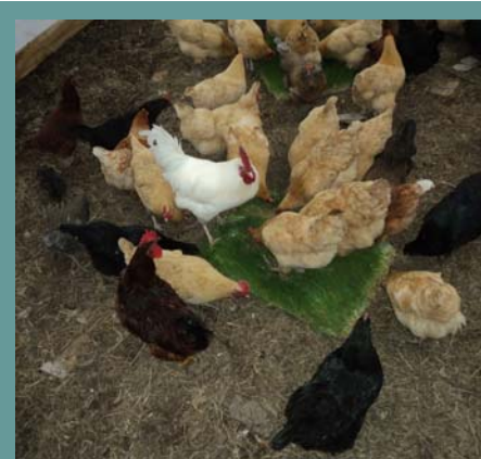
Chickens enjoying the fodder mat, harvested from the hydroponic fodder system.

This system will work with several types of grains. Producers are making fodder from