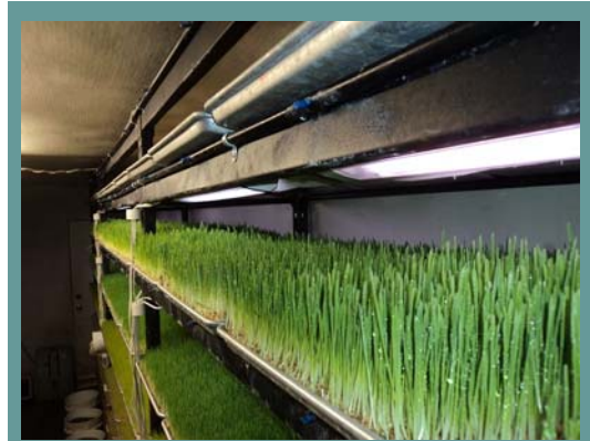
The hydroponic fodder set-up inside a semi trailer cargo container at the Moser's farm.

The basic process for producing fodder hydroponically (in water, without soil) is to soak the grains in clean water for 24 hours and then drain. The second step is to rinse the seed from eight to ten times a day (about every two hours) to as little as once a day, making sure to maintain moisture over the seed at all times. The roots will begin to emerge first in a day or two, followed by the cotyledon (the first leaf of a seed embryo that nourishes the emerging plant). Next, the first true leaves appear. This happens (continued on page 3)