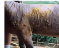
Figure 5 Ringworm lesions

of the hair shaft. Close shearing and washing practices used at shows leave show animals at risk.