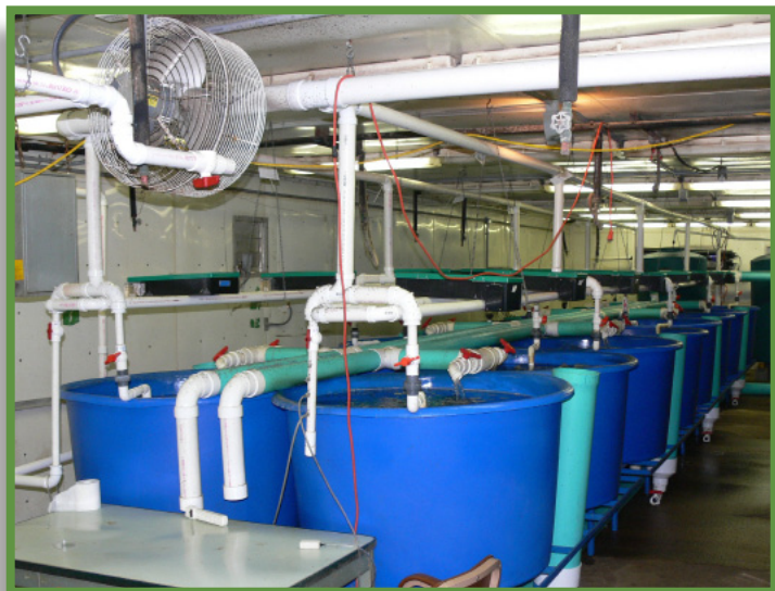
In-house aquaculture tanks at the LU aquaculture facility.

For more information on our Aquaculture program, contact Lincoln University Cooperative Extension and Research at (573) 681-5543 or (573) 681-5380.