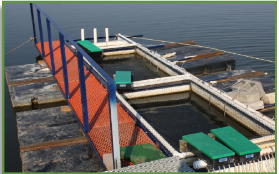
The In-Pond Raceway at LU's Carver farm, near the new aquaculture facility.

Missouri has over 300,000 acres of private lakes and ponds that are constructed for many uses. Mostly, they are used to produce freshwater, high quality fish such as largemouth bass, hybrid bass, sunfish, crappie and catfish for recreational purposes.